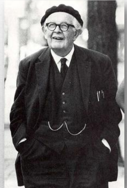
Jean Piaget (1896-1980)

Piaget's theory of cognitive development is a comprehensive theory about the nature and development of human intelligence. It was first created by the Swiss developmental psychologist Jean Piaget (1896–1980). The theory deals with the nature of knowledge itself and how humans gradually come to acquire, construct, and use it. Piaget's theory is mainly known as a developmental stage theory. Piaget "was intrigued by the fact that children of different ages made different kinds of mistakes while solving problems". [2] He also believed that children are not like "little adults" who may know less; children just think and speak differently.